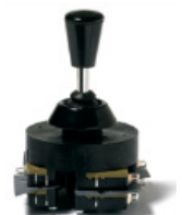
Panel Mounted Joysticks

For more information, contact us at sales@johnsonelectric.com www.johnsonelectric.com