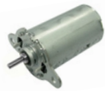
Turbo Wastegate Motors