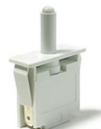
Snap Action Microswitches

For more information, contact us at sales@johnsonelectric.com www.johnsonelectric.com