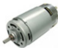
High Voltage DC Motors