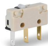
Snap Action Microswitches

For more information, contact us at sales@johnsonelectric.com www.johnsonelectric.com