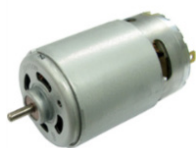
Compact DC Motor

Johnson Electric creates custom solutions beginning with our wide range of component technologies