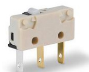
Snap Action Microswitches

For more information, contact us at sales@johnsonelectric.com www.johnsonelectric.com