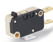
Snap Action Microswitches