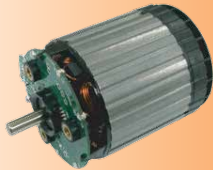
E8 Motor Platform