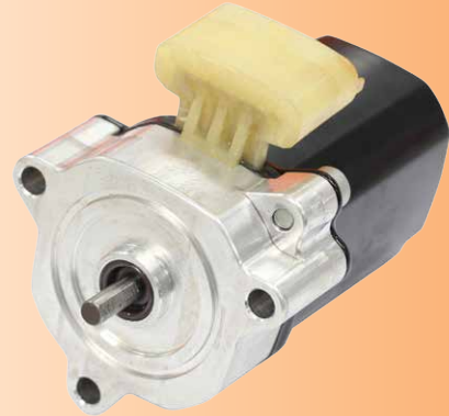
C800 Compact Series